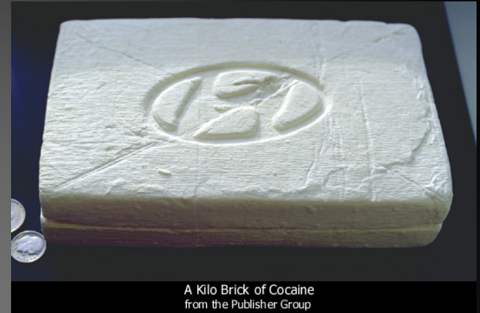
A Kilo Brick of Cocaine from the Publisher Group