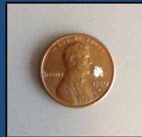
Fatal dose of fentanyl (2 mg or 2000 mcg)