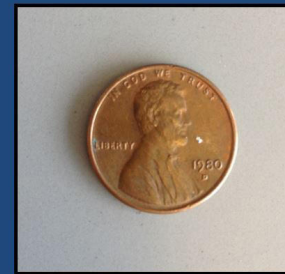
Fatal dose of carfentanil (0.02 mg or 20 mcg)